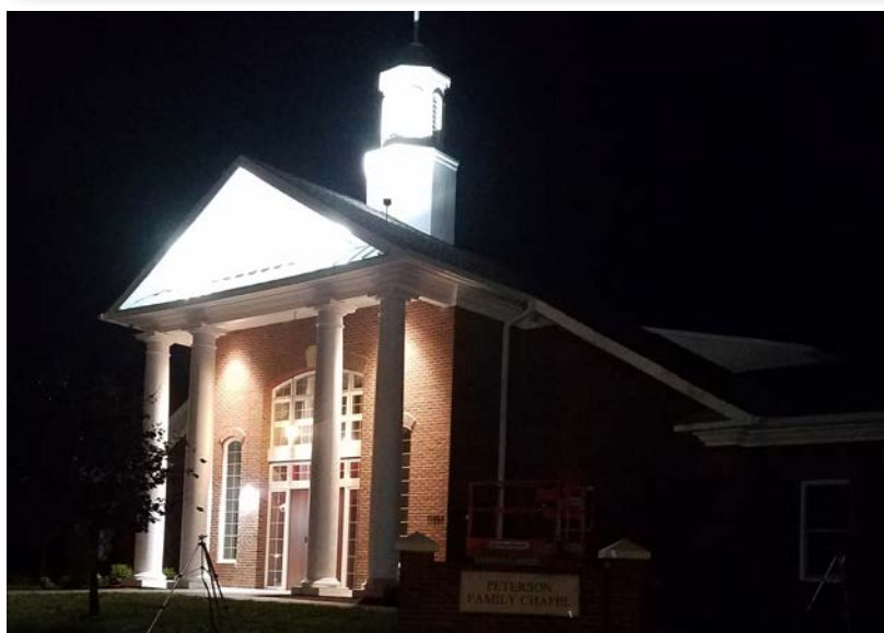
▲ Dedication of the Peterson Family Chapel to be held the Morning of the Country Fair at 10 am.