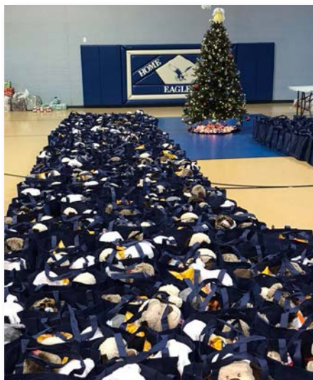
Our kids helped fill bags with food and a stuffed animal to be delivered to families in need which were identified by our TDT Staff, Principals and Counselors in the 34 schools we serve in Prince William and Fairfax County.

Through our Community Outreach and working with our partners in the Prince William and Fairfax County Schools, children and their families were identified in need of assistance for the Holidays. Through generous contributions from our donors and our Thanksgiving Food Drive we were able to provide assistance for over 1,100 families for Thanksgiving and Christmas. Thank you so very much for helping us to help our children and families in need for the Holidays!!