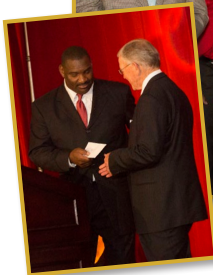
Robert Griffin III was named the Ed Block Courage Award recipient for 2013 and was honored at the Burgundy & Gold Banquet. The Redskins Courage House is located on the YFT campus.